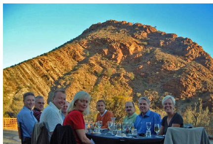
Banquet in the Bush (BIB)