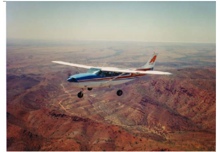
Arkaroola's Cessna 207 6 pax aircraft