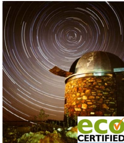
"Star-trails" Stars circling the south celestial pole (Dodwell Observatory)