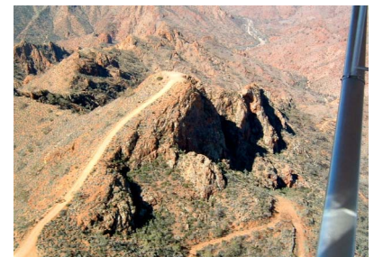
Sillers Lookout from the air

Flights including Broken Hill to Arkaroola subject to weather conditions - we suggest travel insurance.